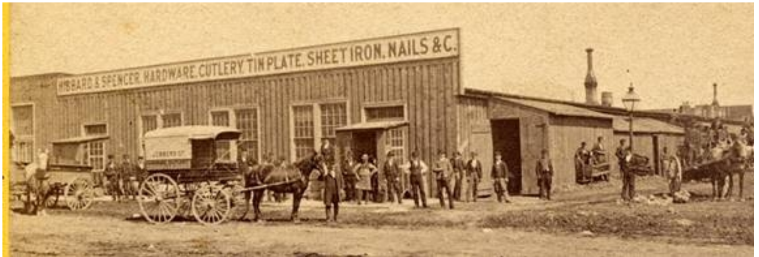
The building where Hibbard and Spencer resumed business after the 1871 fire until the next building was built.