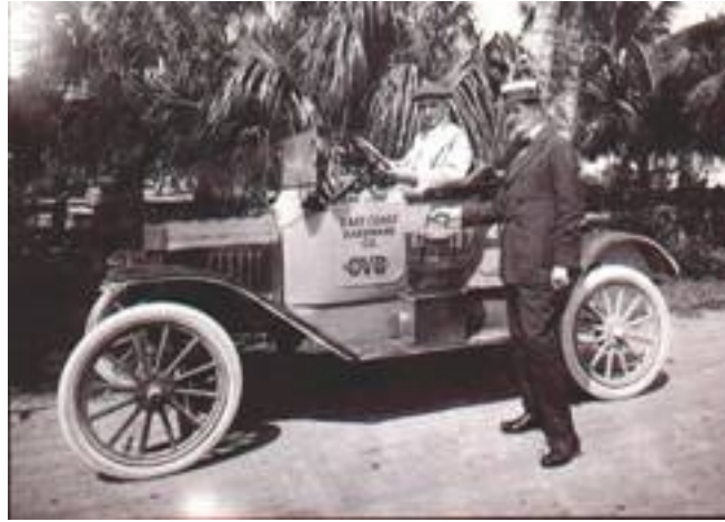
OVB salesman with his car.