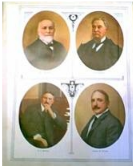
Pictures of Hibbard, Spencer, Bartlett & Charles Conover from HSB 1913 Catalog

From the Archives of The Winchester * Keen Kutter* Diamond Edge Chronicles The Official Publication of The Hardware Companies Collectors Klub www.thckk.org